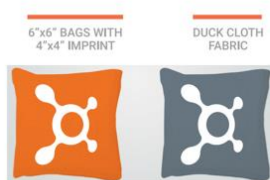
CUSTOM PRINT STICK & SLIDE BAGS (8 PACK)